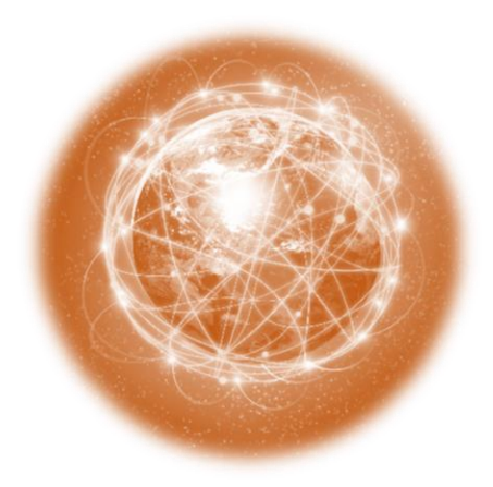
International Networking E-medicine Bioinformatics